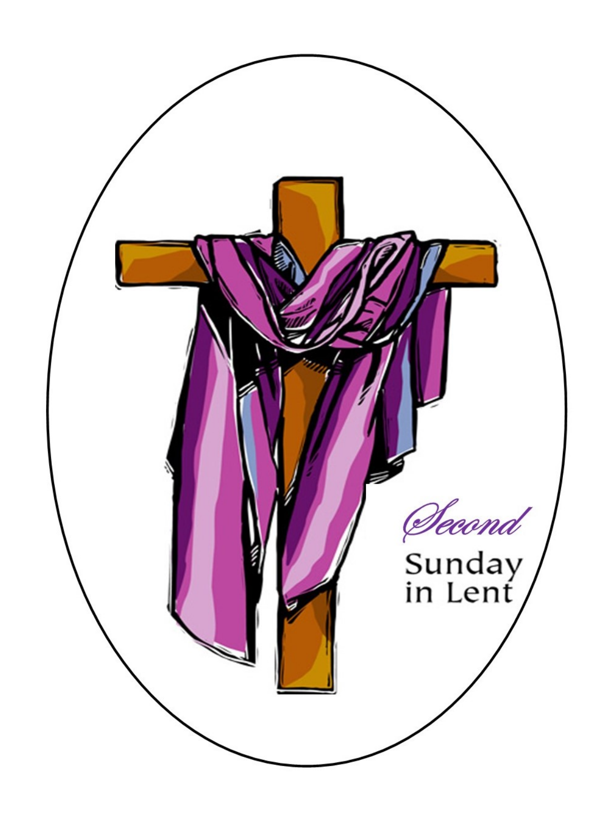
Lake Toxarvary United Methodist Church March 16<sup>th</sup>, 2025